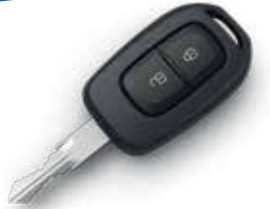
CENTRAL LOCKING AND REMOTE KEY