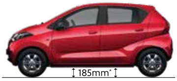
185mm BEST-IN-CLASS GROUND CLEARANCE